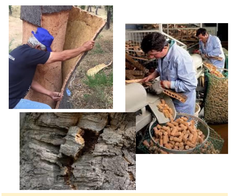
Hand harvesting of cork bark (above, left), the production of cork stoppers (above, right) and the thick, insulating bark of the cork oak.

SUFA : So, my understanding is that the cork is actually your outer bark and is actually dead cells. Please tell our readers how the harvesting process works.